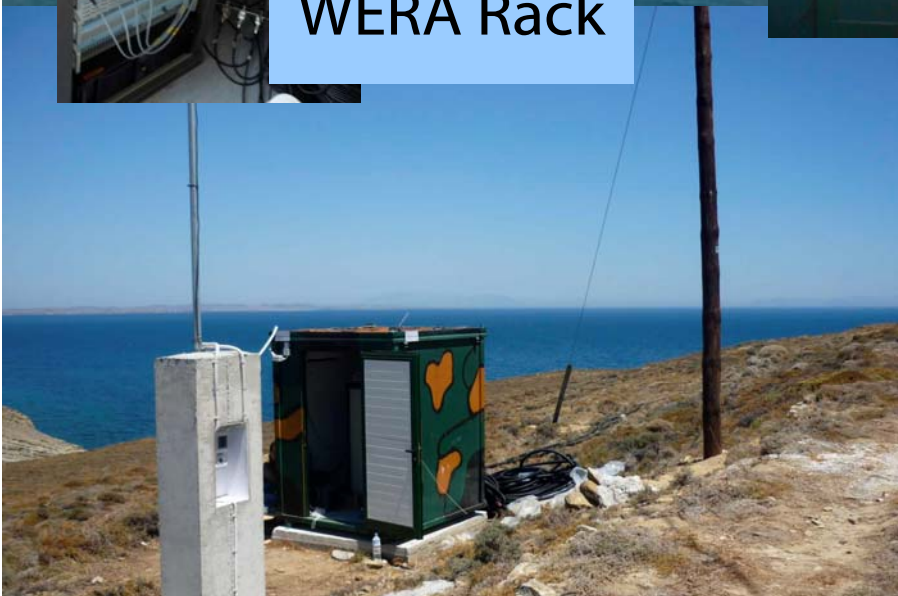
Container with WERA components and power-supply