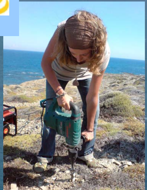
Woman at work